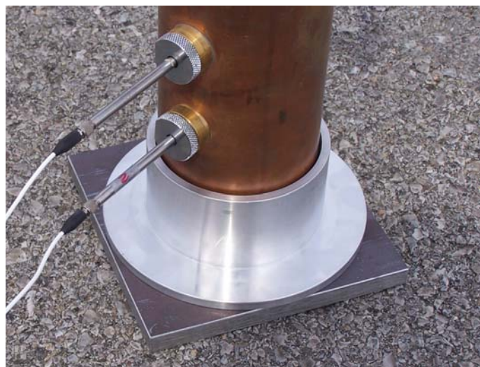
Figure 5: Measurement of tube parasitic absorption.

The third step is to determine the absorption coefficient at each of the selected pavement locations. These are averaged and the parasitic absorption is subtracted to determine the Adjusted Average Absorption Coefficient , shown on the graph in Figure 4.