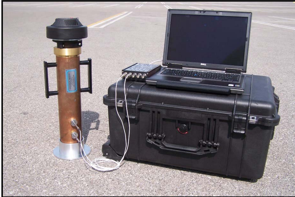
Figure 7: Stand alone system for pavement absorption measurement.