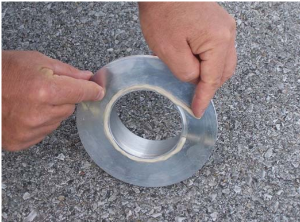
Figure 2: Test fixture showing groove and sealant.

The test fixture at the open end of the impedance tube serves two functions: it creates an air-tight seal with the pavement and provides stability via its flanged base to the entire apparatus. Figure 2 shows the details of the surface of the test fixture that is placed in contact with the pavement. This figure also shows the groove into which the sealant material is placed to provide an air-tight seal between the test fixture and the pavement.