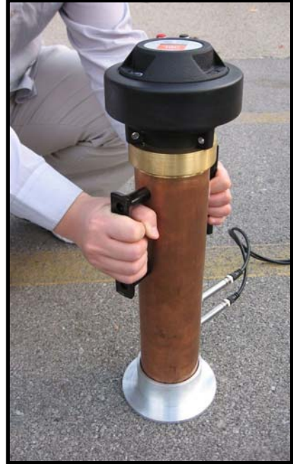
Figure 1: System for measurement of pavement absorption.

Because the measurement of absorption is based on the two-microphone method, it is not necessary to perform an absolute amplitude calibration of the microphones, nor is it necessary to use so-called “phase-matched” microphones. Instead, a relative amplitude and phase (transfer function) calibration is determined using a microphone switching 3 procedure; this calibration is used to correct the measured transfer function of the pavement. In this way, any amplitude and phase differences in the microphones are removed from the measurement.