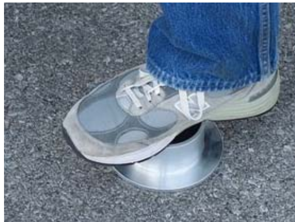
Figure 3: Exerting a uniform pressure on the test fixture at a typical measurement position.

A typical sealant is water-soluble modeling clay. Only enough sealant to fully seal between the test fixture and the pavement should be used. If there is too much sealant, the excess will squeeze into the inside of the test fixture and onto the pavement, resulting in a biased result. Some trial and error is necessary to determine the proper amount of sealant. Figure 3 shows one way to place the test fixture on the pavement to obtain uniform results. Before inserting the impedance tube into the test fixture, the user should remove any excess sealant that was squeezed into the area inside the test fixture.